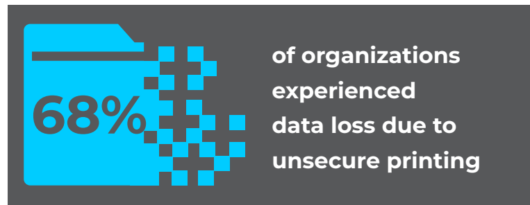
*QUOCIRCA Printer Security Landscape 2022

Threat actors are constantly probing the environment and changing their tactics making businesses even more susceptible to malware incidents and data breaches. Cybercriminals know MFPs and printers are often overlooked, and just like a PC, they can serve as an on-ramp to your network. In fact, in the previous year, over two-thirds (68%) of organizations across the US and Europe experienced data loss due to unsecure printing practices.*